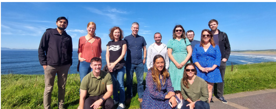
Enterprise Ireland's New Frontiers ATU – Sligo Donegal participants for 2023

To find out more about ATU Sligo Innovation Hub please click here .